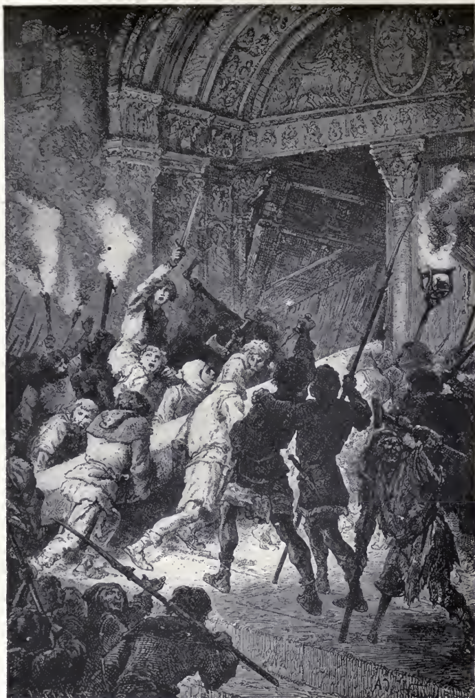
INSURRECTION IN FAVOR OF THE COMMUNE AT CAMBRAI